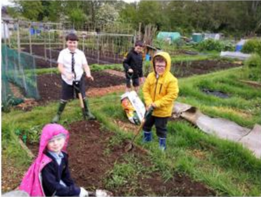
On our allotment.