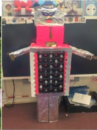
Year 1 Robotics Lab