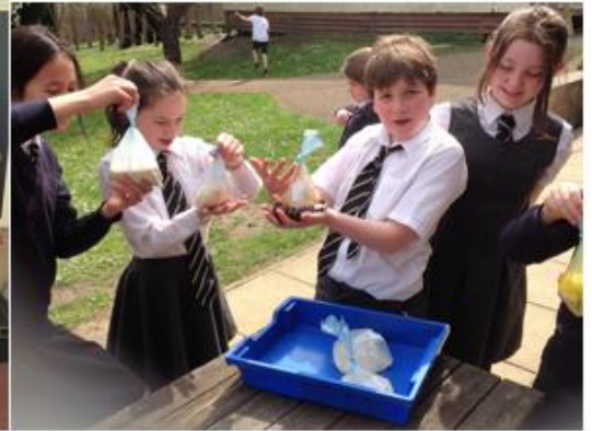
Year 6 Science work.