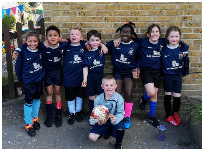
KS1 Football Team L-R