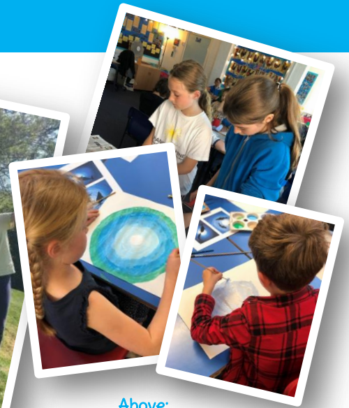
Above: Our Artists at work during Arts' Week