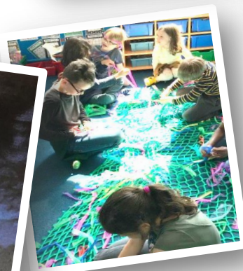
Left: Some of the artwork produced by the children this week