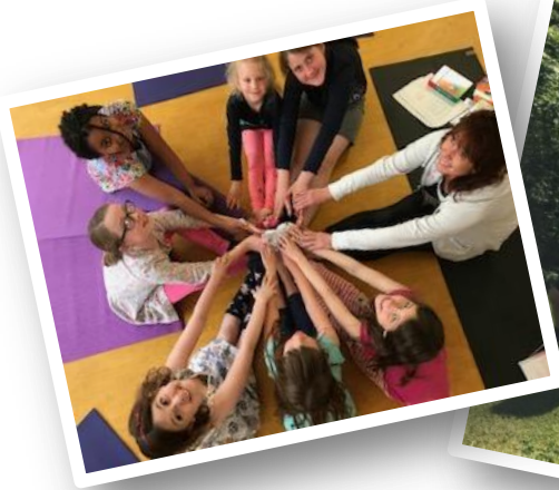
Above: Yoga Pickles Club