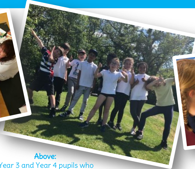
Above: Year 3 and Year 4 pupils who went to Mojo Active this week