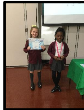
Out of School Achievements Awards