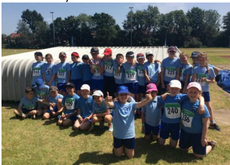
A very big ' Well done! ' to all of the children who took part in the Rugby

Our Wonderful Week - In whole-school assembly we reflected on the Feast of SS Peter and Paul. They both came to meet God in a special way. Peter became the 'rock' and our first Pope. He helped to spread the Gospel and teachings of Jesus in the Holy Land among all Jewish people. Paul was a great teacher, formerly a persecutor of Christians. He was called to travel widely and reach people in other countries who had never heard of Jesus. Each of these saints in a different way gathered our Church together and suffered as martyrs in Rome. We also had our own Class Liturgies this week praying together as a class community.