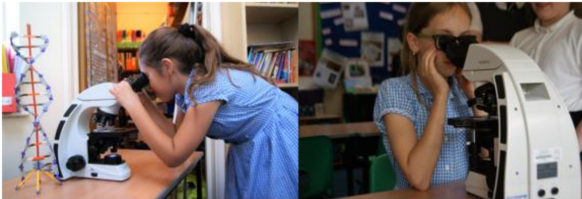
Year 6 investigating cell structures with the help of Bath University.