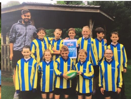
TBF NSL Football team 2019!