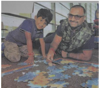
Space to read, learn, play

Yesterday our children used their foraging skills in Forest School to gather fruits. The fruits were used in creating a scrumptious fruit crumble!