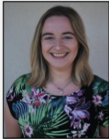
Miss Mylan Ladybirds