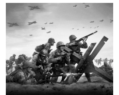
D Day landings

"We shall fight on the beaches. We shall fight on the landing grounds. We shall fight in the fields, and in the streets, We shall never surrender!"