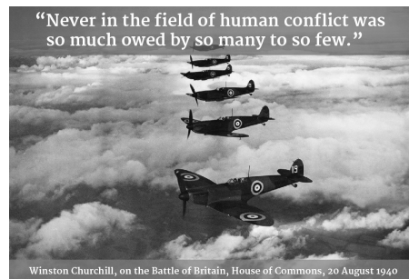
"Never in the field of human conflict was so much owed by so many to so few."

"We shall fight on the beaches. We shall fight on the landing grounds. We shall fight in the fields, and in the streets, We shall never surrender!"