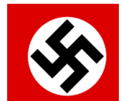
Swastika (Nazi symbol)