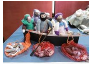
The Knitted Bible