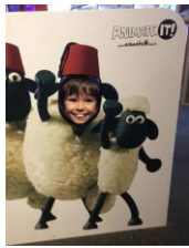
We The Curious

Welcome to our October Newsletter. We have had a productive and exciting start to the year, with events including Aspirations Week, our school trip to We The Curious and a space workshop! These events have inspired your children to produce excellent work which we have celebrated each Monday in our Collective Worship.