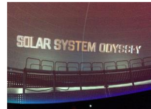
We The Curious

Please follow us on Twitter through the school account or class pages, to keep up to date with all the news and exciting learning happening in our school! The website will continue to provide you with up to date events and notifications. If you haven't downloaded our School Updates App, then please do so.