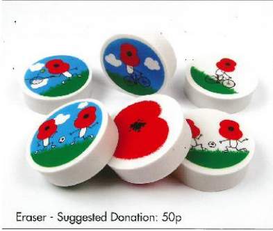
Eraser - Suggested Donation: 50p