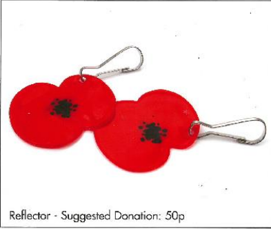
Reflector - Suggested Donation: 50p