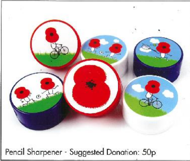
Pencil Sharpener - Suggested Donation: 50p