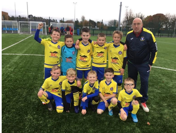
Carrickmannon & Alexander Dickson Matches