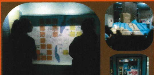
Imperial War Museum

Come on Year 2...let's get into school on time and get our learning started!!!