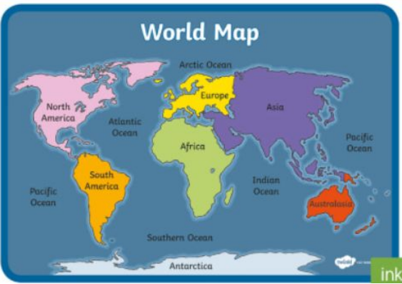
Continents and Oceans.