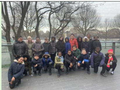
Year 6 really enjoyed their trip to the Old Bailey this week to support their topic of Crime and Punishment.

What better place for an alien to go unnoticed than the backlot of Universal Studios? Full of humour and with an appealing plot, this book shows that, human or alien, we all need kindness and understanding to achieve our dreams and flourish.