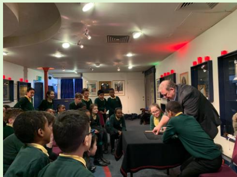
Year 5 paid a visit the Magic Circle Headquarters to learn all about the history of magic.

We are now accepting applications for our Nursery for September 2020 for children turning 3 years old before 31 st August 2020. Please return your form as soon as possible to avoid disappointment. Places will be allocated on a first come first serve basis.