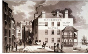
Mahomed's Baths stood on the site now occupied by the Queen's Hotel Brighton

So successful was his treatment that Hospitals referred patients to Sake Dean Mahomed. Both King George IV and William IV appointed him as their shampooing surgeon in Brighton. Mahomed's Bath stood on the site now occupied by the Queen's Hotel, Brighton.