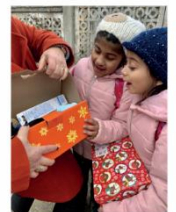
Shoobox school pack

T4U real people making a real difference