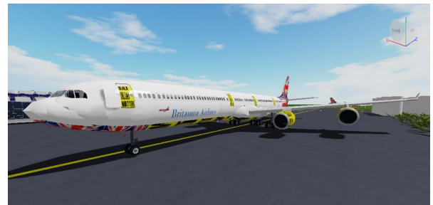
An Airbus A340 with our logo and the black lives matter logo