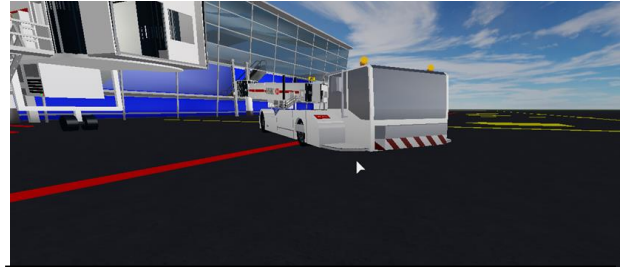
A pushback truck, used for pushing airplanes backwards from the gate

Stay tuned to further developments as we plan to complete the developing over the coming months!