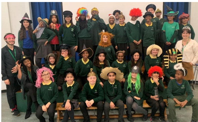
Year 6 celebrated Anti-Bullying Week by showing we are all unique but all equal.