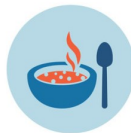
LOSS OF TASTE AND SMELL