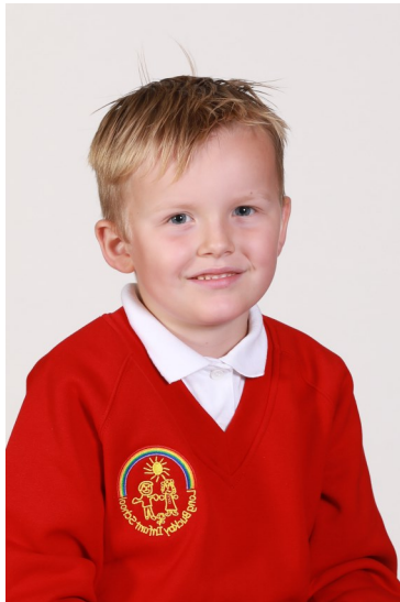
Theodore J Green Class