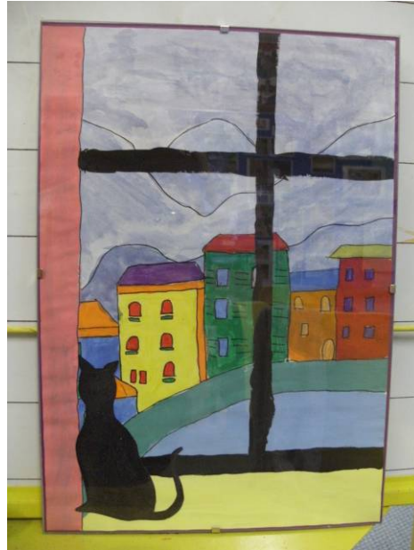
A watercolour showing