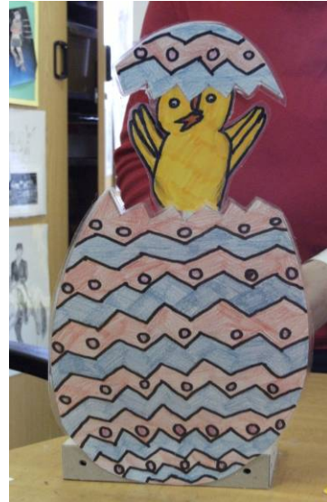
A pop up Easter Chick using a pneumatic mechanism