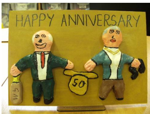
Sculptures using clay