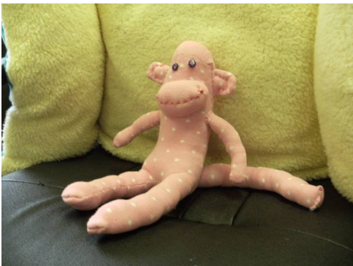
Sock monkeys (not really Easter related, but very impressive)