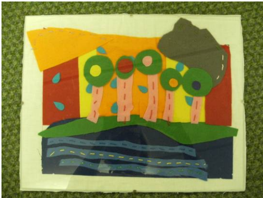
A felt collage in the style of Hundertwasser