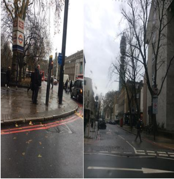
London's Oxford Street looking festive for the season.