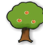
Finedon Infant School

Teachers will get involved and help you solve problems. They can talk to your parents and talk to your friends.