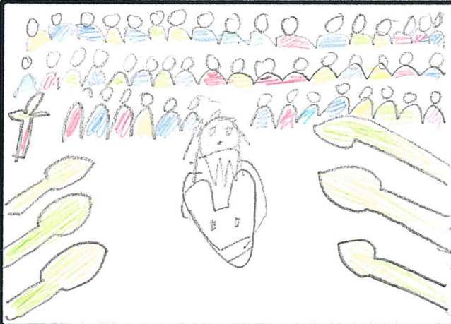
This is a picture of Jesus entering Jerusalem.

Yesterday an outstanding event happened in Jerusalem. Jesus, who was riding a grey donkey, was hailed with palm leaves. I wonder why? A lot of people loved this event, and will remember this one in a lifetime moment.