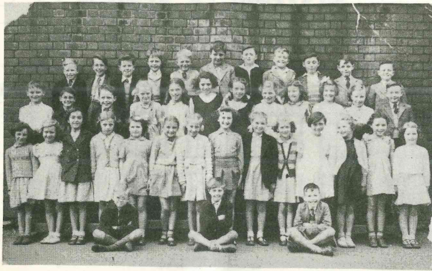
1951 A senior class in Ulsterville Junior School a quarter of a century ago.