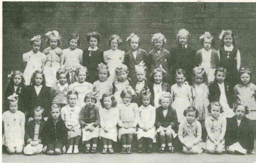
1953 One of a series of well preserved photographs taken in Coronation Year.