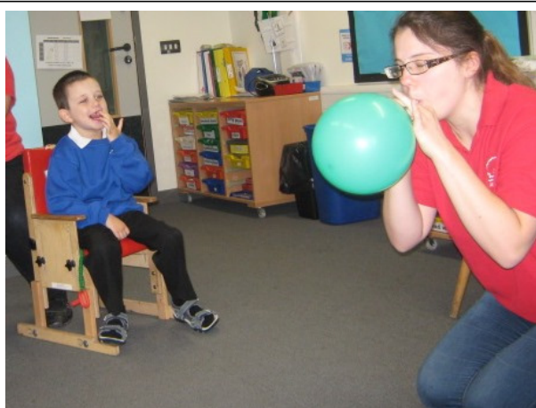
Stage 1 – Focus Attention

(The Table Activities – Transition) The pupil will can now sit through Stages 1-3. They can now watch the adult demonstrate a simple activity they are now learning to take their box/tray with equipment to the table and carry out the given task independently as possible. When complete return to refocus as part of the group to review the activity, by looking at/talking about theirs & others completed task & celebrate achievements. The pupil can now engage up to 30 – 40 minutes.