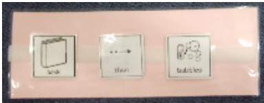
Symbol timetable (using now and finished)