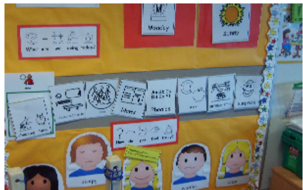
Whole class symbol timetable

It helps pupils on the autism spectrum to understand, predict and control their environment. If a timetable is set up and working effectively the pupil should be able to operate more independently within their environment and it should lead to a decrease in anxiety levels.