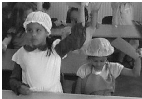
Wrens Class enjoying Victorian number work