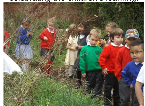
Parrots in the Wildlife Garden

Our website has been undergoing an overhaul recently and is now updated. The class pages have lots of photographs celebrating the children's learning.