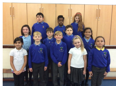
Dalton School Council

They will be announcing the winner from each class in their school council assembly on the last Friday of this half term - if all goes to plan!