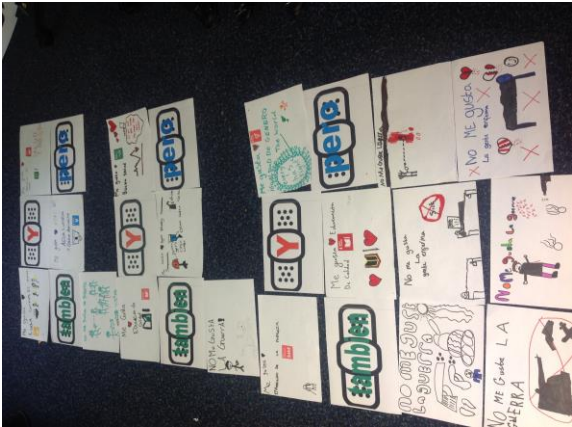
Year 4 are having fun while 'playing' with the Global Goals!