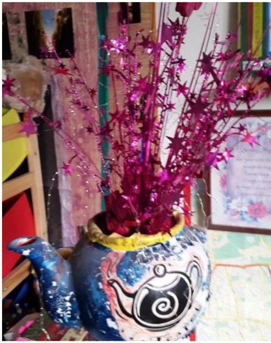
Dan's creative project