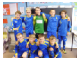
Year 6 Boys