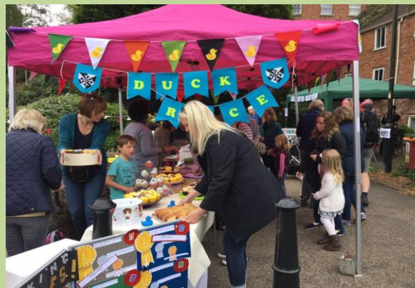
The Famous St Dominic's Duck Race at the Nailsworth Festival 2017