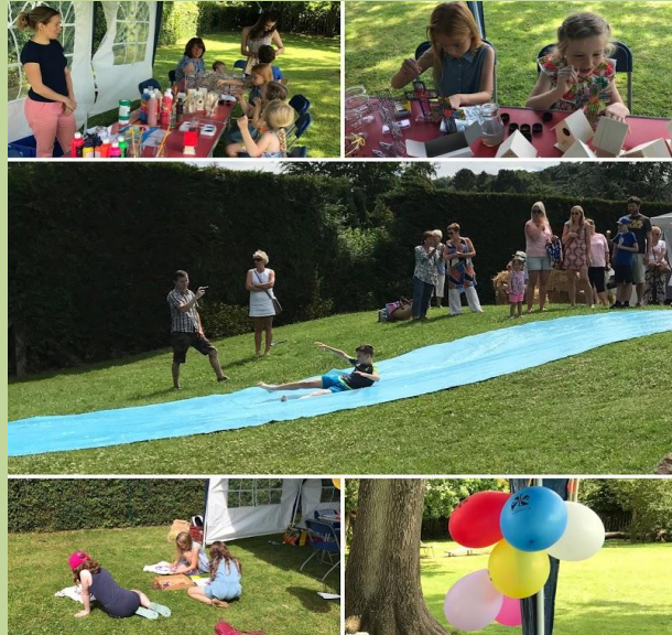
School Summer Fete 2017

At the end of the year we will be holding the Christmas Bazaar and potentially a Christmas Craft Fair. Please get involved either as a volunteer or by joining the Committee to help organise! If you are arty-crafty perhaps you would like to have a stall and help raise money for the school? We hope to hold some welcome/social events this term too!