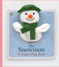
'The snowman Puppet book'

As part of our topic – Celebrations - We will be looking at