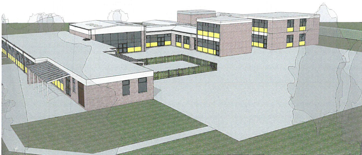
3D View 3 - Existing (Bird's Eye from East)