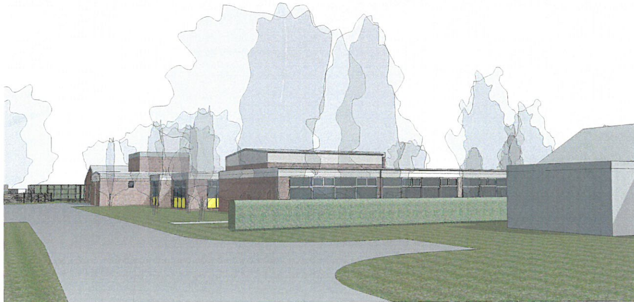
3D View 2 - Existing (from South)