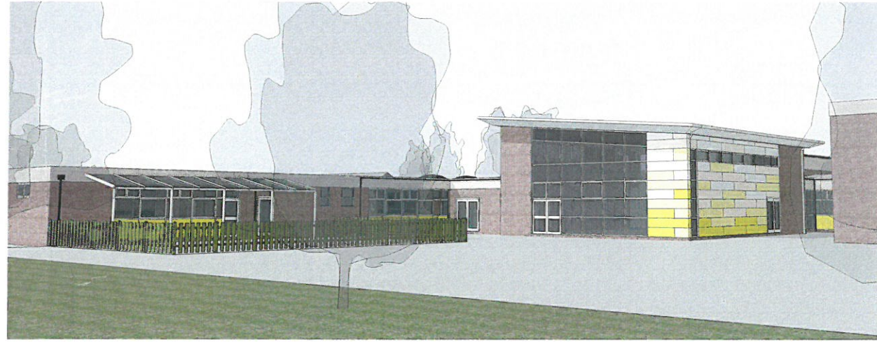
3D View 1_Proposed (from North East)