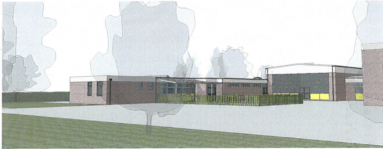
3D View 1_Existing (from North East)

NOTES This Drawing is an instrument of service and shall remain the property of Mouchel. It may not be reproduced or copied in any form. It shall not be used for the construction, enlargement or alteration of a building or area other than the said project without the authorisation of the issuing office. Contractors shall verify and be responsible for all dimensions and conditions and shall report any discrepancies to the issuing office before proceeding with any work. Drawings shall not be scaled. Based upon Ordnance Survey material with the permission of Ordnance Survey on behalf of the Controller Her Majesty's Stationery Office © Crown Copyright and Database Rights 2014 Ordnance Survey 100030649