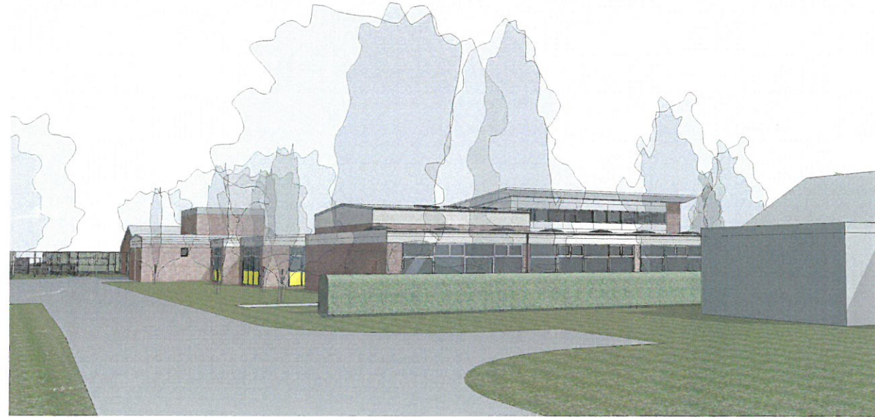
3D View 2 - Proposed (from South)