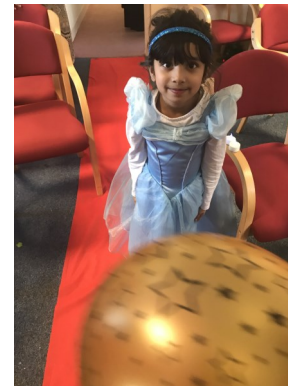
How to dress like a Princess!