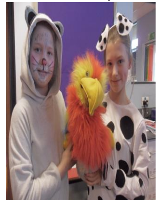
World Book Day in Y6.

Well done Y6 for achieving the highest attendance last week of term.