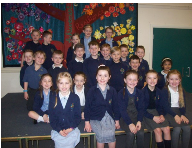
Stars of the Week Riverwood