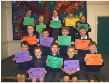
This weeks Earth Award winners

01422 354209 head/admin/clerical@copley.calderdale.sch.uk