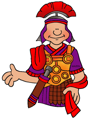
Swords and Sandals