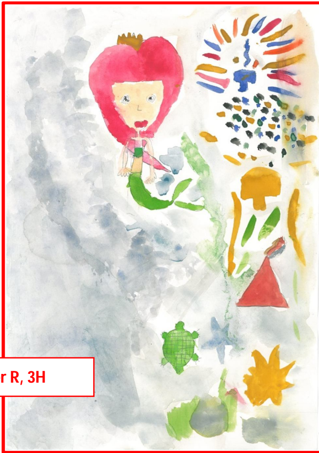
Amber R, 3H