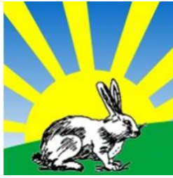
Harefield Infant School