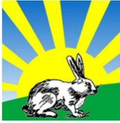
Harefield Infant School