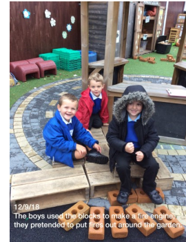
12/9/18 The boys used the blocks to make a fire engine, they pretended to put fire out around the garden.

Our new Reception children have settled in beautifully and have been enjoying their first full week of school. We are very proud of all of them! Thank you to all of our parents too for their brilliant support.