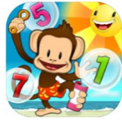
Monkey Math School Sunshine £1.99 (iOS) £1.79 (Google)