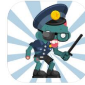
Math Vs Zombies Free (iOS) Free (Google)