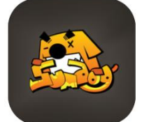
Sumdog Free (iOS) Free (Google)