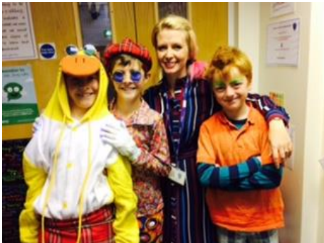
Thanks to the chaplaincy team for organising our 'Brighten Up for Harvest' We had great fun raising money for Cafod