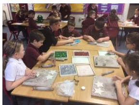
Year 3 have been making tea-light holders

Our Christmas fair is fast approaching and there is a buzz of excitement among the children as they are busy making lovely things to sell on their class' stall. This year the fair is being held on a Friday, in the hope that all children can attend with the person/people collecting them from school. The children are going to be running the stalls with the help of their class teacher. Each stall will have a game to play and something to buy. In order to make it as fair as possible the class teacher has a list of time slots from 3.30-5.30 so each child can sign up for a 15-minute time slot to help out. This way they can be involved in selling on their class stall as well as having time to go and enjoy the rest of the fair. Time slot lists will be available in KS1 from Monday and KS2 children will complete them in class. Can I suggest KS2 parents tell their child/ren a time that will suit your family. We really hope to see you there and help make this annual PTA event a success.