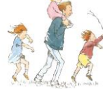
We're Going on a Bear Hunt Michael Rosen Helen Oxenbury